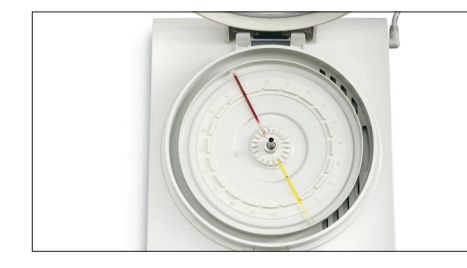
8. Centrifuge the tube in the IDEXX VetCentrifuge™ for 5 minutes. Make sure to balance the centrifuge with another tube directly opposite the sample. Ensure that the centrifuge cover is properly fastened. (Bovine samples should be spun twice with a three-minute wait in between to ensure cooling of the centrifuge.)

7b. Alternate method: Use forceps to insert the float.