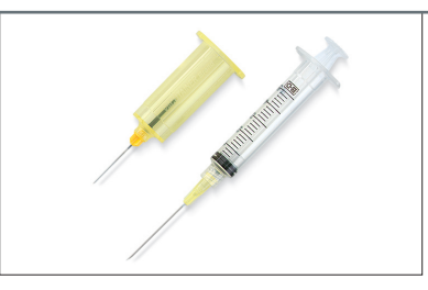
2. Use the appropriate samplecollection devices.